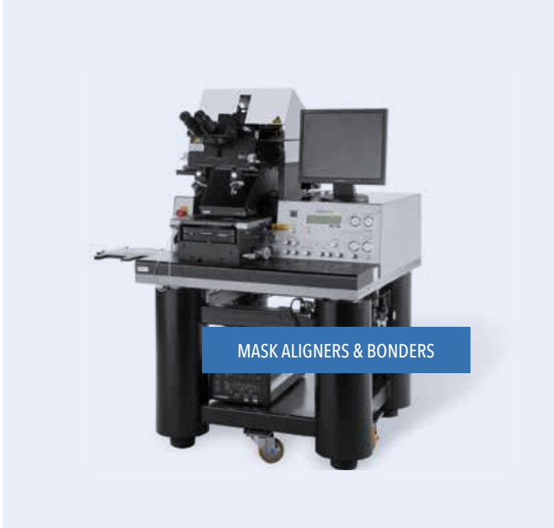
MASK ALIGNERS & BONDERS