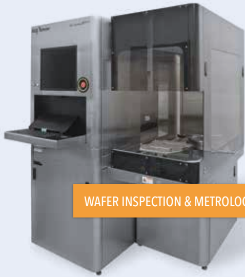
WAFER INSPECTION & METROLOGY